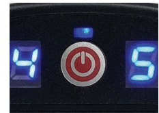
4. If the device is on and charging, the LED indicator on the device will be BLUE.