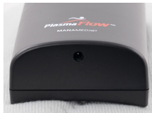
1. Find the charger port on the PlasmaFlow device.

When Device is ON: The AC Adaptor can be connected while the device is in use. Plug the charger into the bottom of the controller on the device. Plug the end of the charger into an electrical wall outlet.