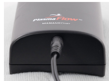
2. Plug the charger into the charging port on the PlasmaFlow device. Plug the power supply end of the charger into an electrical wall outlet.